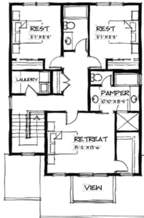
UPPER FLOOR PLAN 1100 SQ. FT.